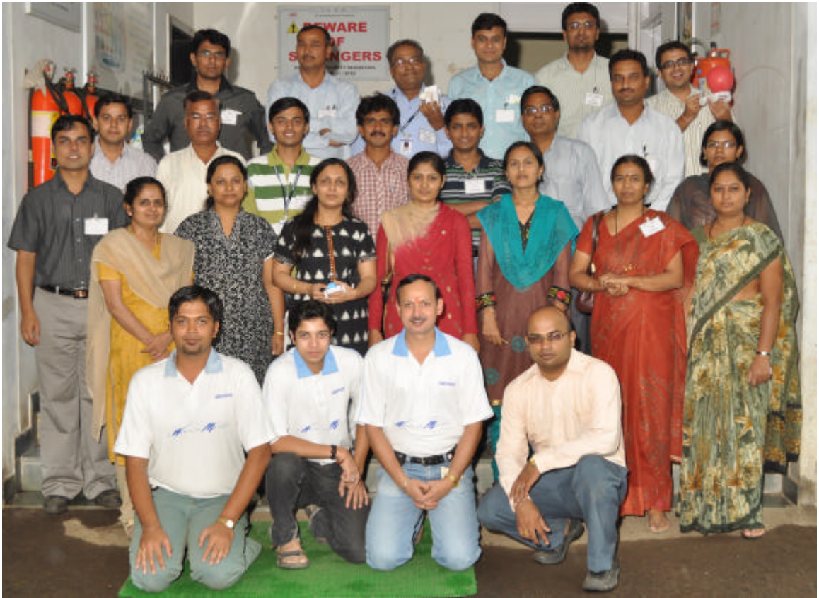
The Team for "Volunteer & Teachers" training Program