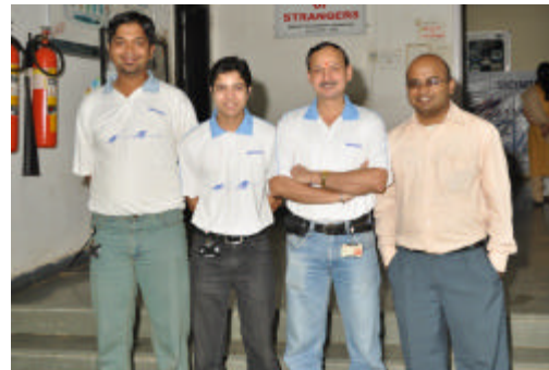
The Team all set for the Training