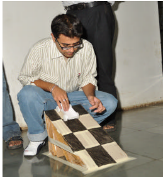
Engineers at Work - "Enjoying their Creations"