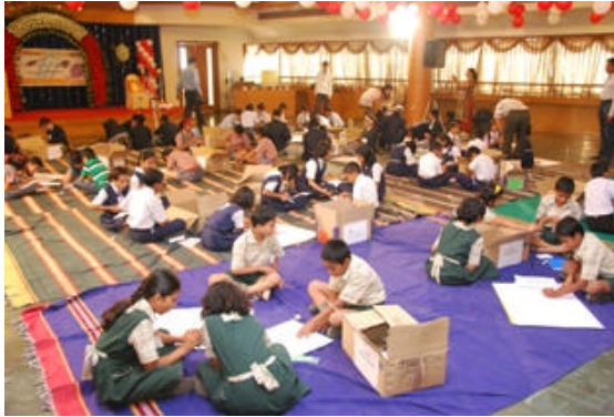
Students engrossed in the Toy making.