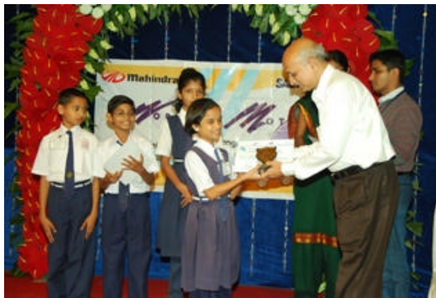
Seth Ramnath Jaju Madhyamik Vidyalaya