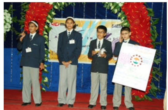
Children answering the question of the Jury