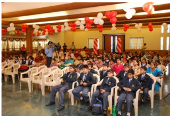
“Students, teachers & parents at the venue”

16 teams from 8 schools participated in the event. 64 students who are presently studying in their 6th standard participated in the event with great enthusiasm and passion.