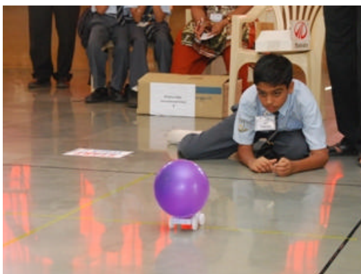
"Testing by no means is an easy job"

At the Nasik Olympics students displayed more than one car and decided name, logo & slogan of their team and wrote the specification of their vehicles in a Chart. It was a tough time for the Judges due to numerous ties. The aesthetics round was the most difficult one to judge, since each & every car was beautifully decorated.