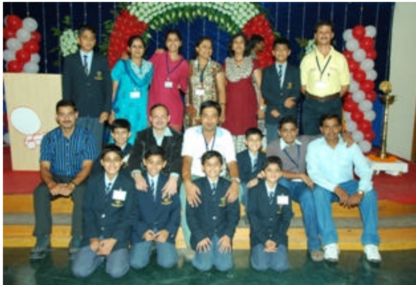
Wisdom High International School