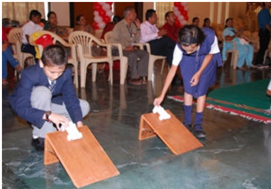
-Testing the chassis on the ramp.