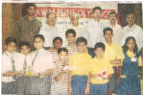
Winners of the AWIM contest