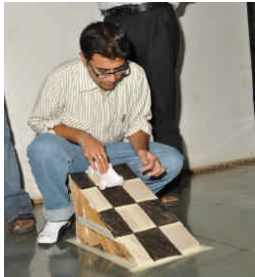
Engineers at Work - "Enjoying their Creations"