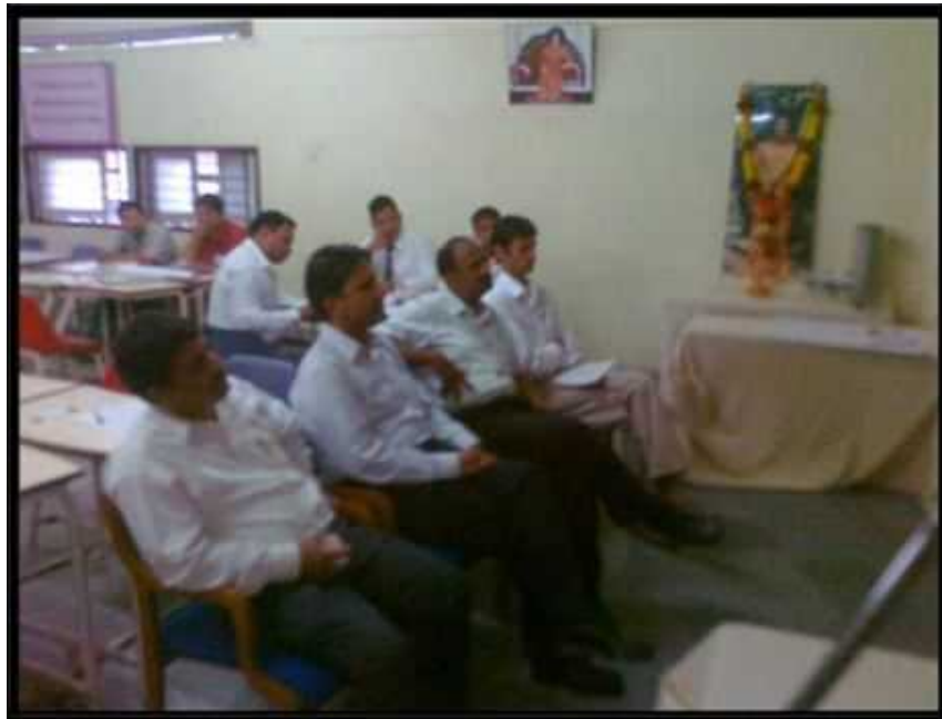
Team of Judges