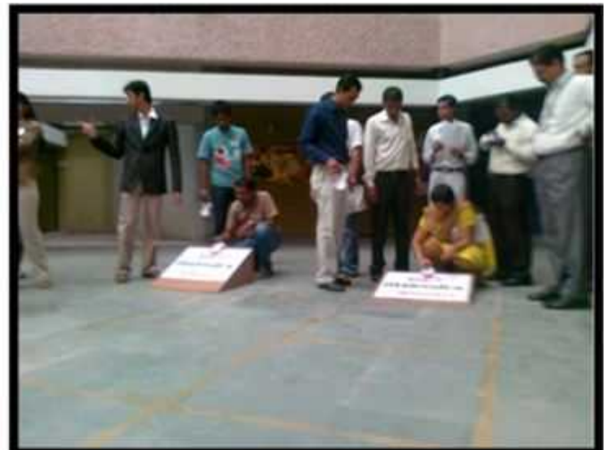
Testing without Balloon