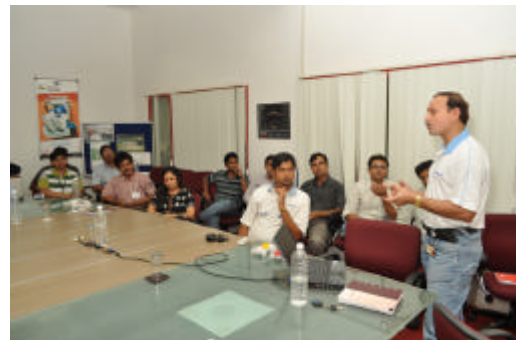
Taking through the concepts of AWIM

Teachers of 8 school along with their Volunteer wholeheartedly participated in the “Volunteer & Teacher Training 2010” in there Quest to learn more about the “Jet Toy Car”, so as to enable them to come close to the 6 th standard students and satisfy the overall goals of AWIM which are,